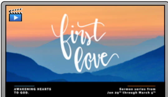
1. first love_promo slide 1-01