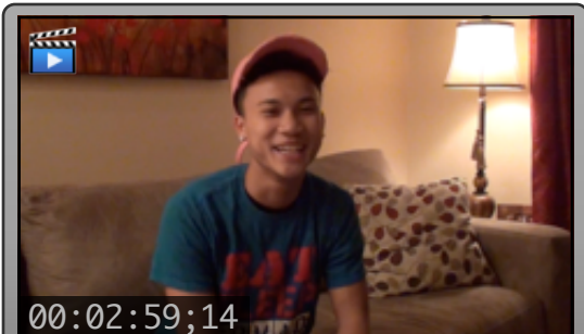
11. COLLIN'S STORY