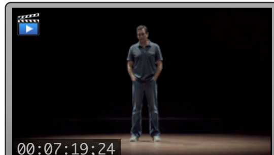
2. The Prodigal